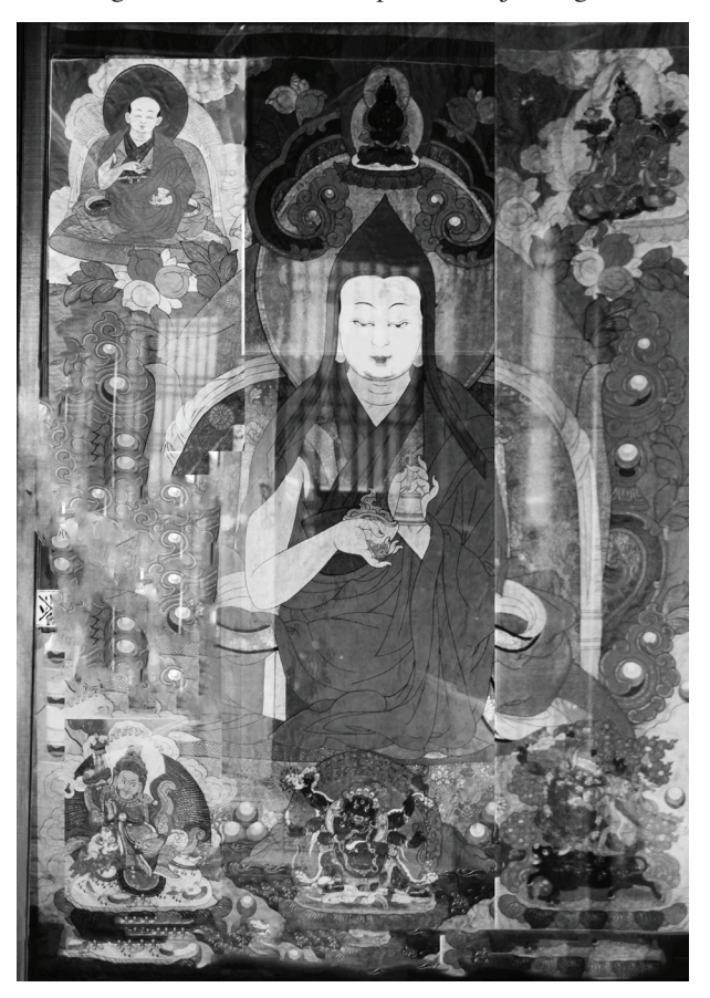
Appliqué thang-ka of Grags-pa-rgyal-mtshan at Erdeni-zuu. Undated, but perhaps 19<sup>th</sup> century. In the upper register: Rje-btsun-dam-pa Zanabazar, Buddha Vajradhara, Green Tārā. In the lower register: Yellow Jambhala, Six-Armed Mahākāla, Dharmarāja.

none other than the Gzims-khang-gong-ma sprul-sku referred to above and the focal point of much acrimony in contemporary Tibetan Buddhism; for it was this figure who, following his suicide (1654), which was presumed to have been an outcome of his rivalry with the Fifth Dalai Lama, would later reemerge as the contentious spirit Rdo-rje-shugs-ldan.<sup>3</sup>